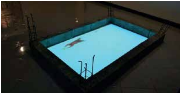
Space #1 (video projection on floor) 5 minutes (looping), 2013 https://vimeo.com/66559379