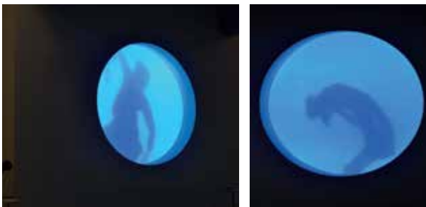
Space #2 (video projection on wall with instalation) 2 minutes (looping), 2014 https://youtu.be/qOe7oYVICcg