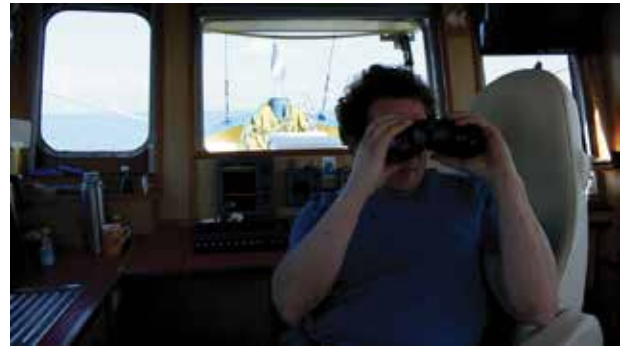
Maja's Boat 15 minutes, 2017 https://youtu.be/lf6fBfgCnEI