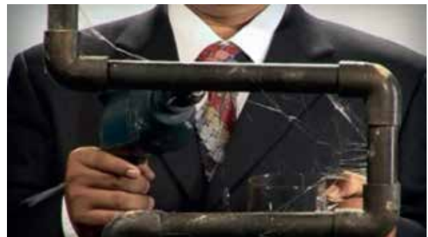
Pembocoran Aliran Dana (Public Service Ad) 60 second, 2015 https://youtu.be/x6CHwh_nwul