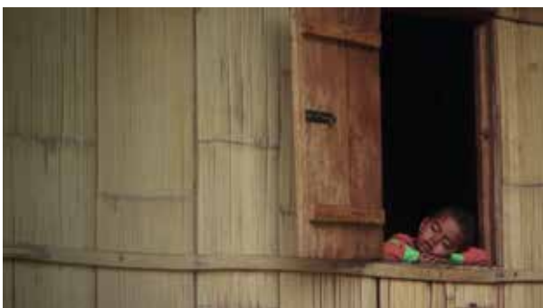
Welu de Fasli (short documentary film) 10 minutes, 2016 https://vimeo.com/192812095 (pass: welu de fasli)