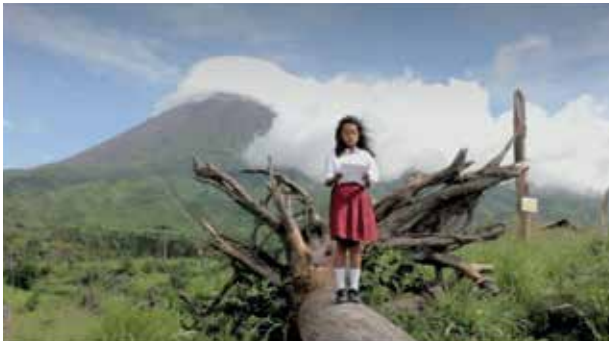
Merapiku (short documentary film) 4 minutes, 2011 https://vimeo.com/88359018