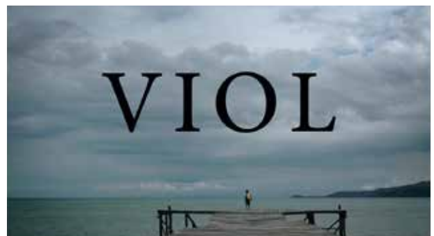
Viol (short film) 14 minutes, 2017 https://youtu.be/5JalmDhZPVQ