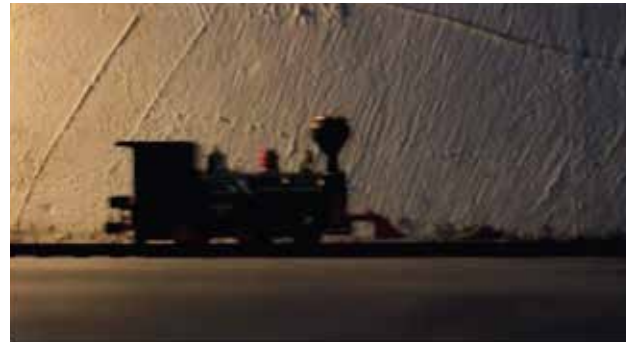
Perjalanan (short film) 4 minutes, 2012 https://vimeo.com/138700188